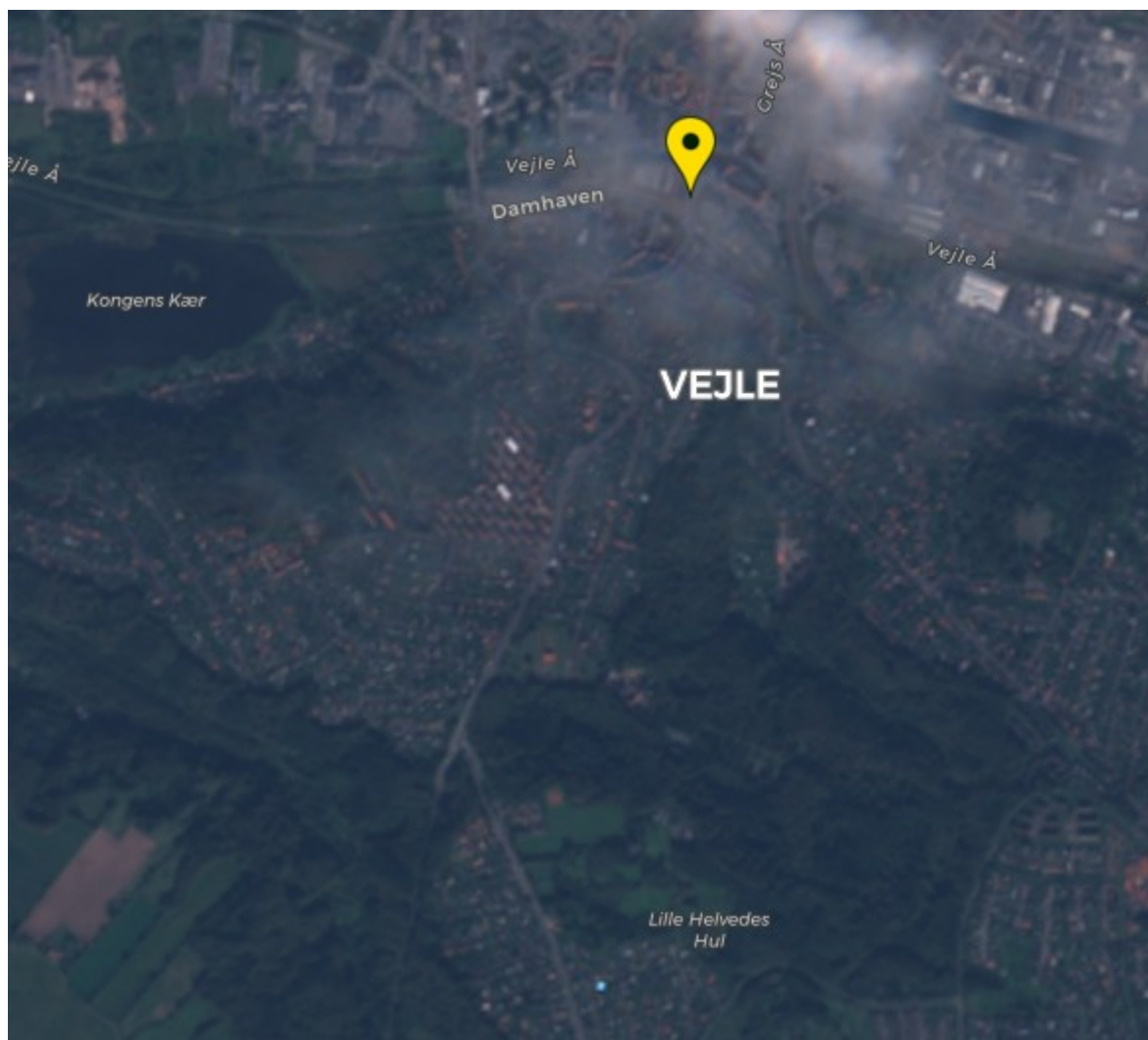
Figur 1: Billede fra Vejleområdet.